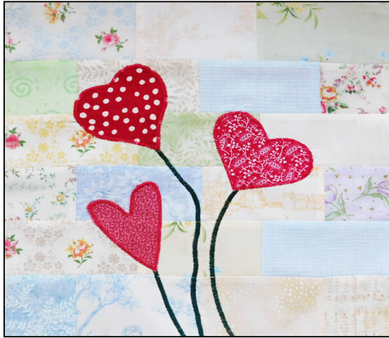
For your valentine . . .