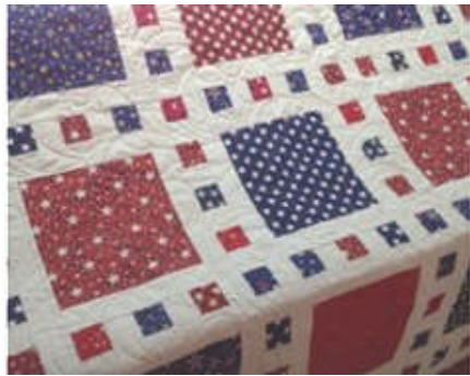
Finished quilt will look like the above.

Materials needed are plain white or white tonal, Medium blue small print, Medium red small print. Please do not use any large prints or colors that are not medium in tone.